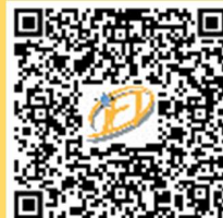
IFTM App 澳門旅遊學院應用程式