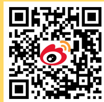
Sina blog 新浪